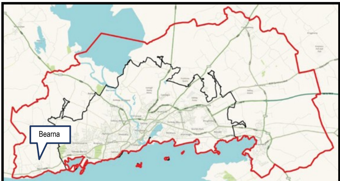
Figure 1: Extract from RSES showing the indicative location of Bearna within the MASP boundary.

Presently, the settlement of Bearna can be described as a “Key Town” at the edge of Galway City. However, this area is earmarked for strategic growth purposes. In particular, it is located and within the designated extent of the Galway Metropolitan Area Strategic Plan (MASP), as set out in the Regional Spatial & Economic Strategy (RSES).